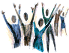
Serve the Lord with Gladness

Reminder: The goal of our church is to receive monthly offerings of $19,167.00. We pray that the Lord’s grace will cause our hearts to overflow with generous donations of our time and offerings so that his saving Word may continue to be proclaimed. Pray that our offerings give glory to God. Solomon wrote, “Honor the Lord with your wealth.” Proverbs 3:9